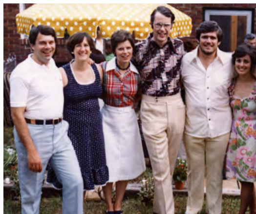
THE SAME HAPPY GROUP IN 1977