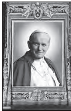
Beatification image of John Paul II