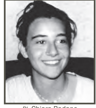
BI. Chiara Badano

"Medicine has laid down its weapons," she wrote. "With interrupting the treatments, the pains in my back have increased. I can scarcely move. I feel so small and the road ahead is so hard. ... I often feel that the pain is suffocating me. It is the Bridegroom who is coming out to meet me, no? If I also repeat with you: 'if you wish it, I also wish it' ... with you I am sure that together with him we will conquer the world!"