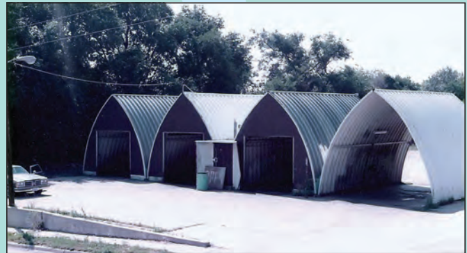
The car wash formerly at 6901 Mercy Rd. in Omaha.