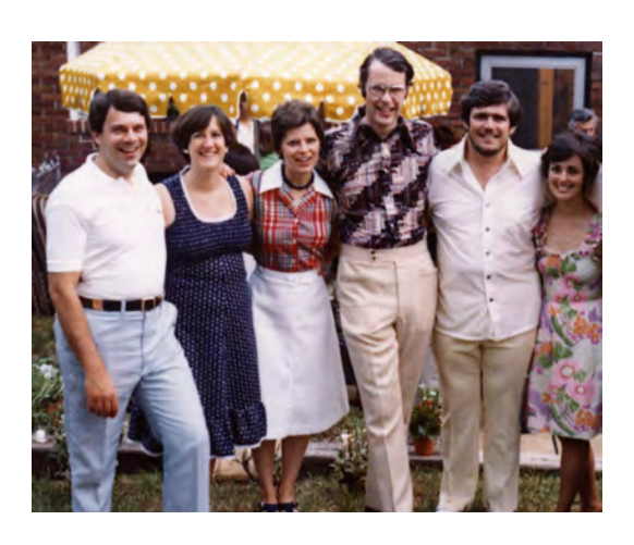
THE SAME HAPPY GROUP IN 1977