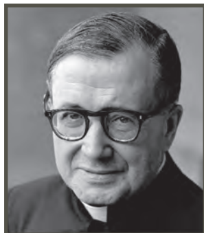
St. Josemaría Escrivá

...[H]e started his priestly studies at the Seminary of Logroño, passing on, in 1920, to the Seminary of Saragossa...he also studied Law at the University of Saragossa. His generous and cheerful character and his straightforwardness and calm approach to things won him many friends. His life of piety, respect for discipline and endeavour in study were an example to his fellow seminarians...[and] he spent many hours praying before the Blessed Sacrament. ...As he recalled on 2 October 1968: Since I felt those inklings of God's love, I sought to carry out, within the limits of my smallness, what he expected from this poor instrument. (...) And, with those yearnings, I prayed and prayed and prayed, in constant prayer. I kept on repeating: Domine, ut sit!, Domine, ut videam!, like the poor fellow in the Gospel, who shouted out because God can do