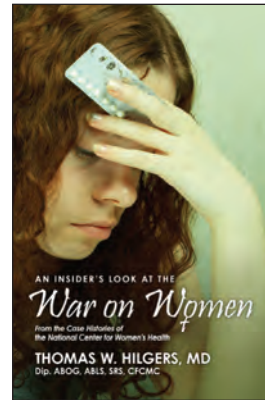
An Insider's Look at the War on Women was published in 2014.

this passion, and so far, I have met 13 candidates on the campaign trail. Many of them spend an hour or more at a campaign stop personally greeting everyone in attendance, making it easy to meet with them one-on-one.