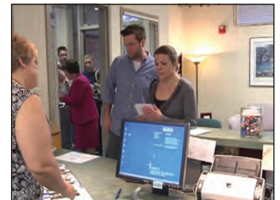
Voices in the Desert tells the story of the Pope Paul VI Institute and its role in women's reproductive health care.