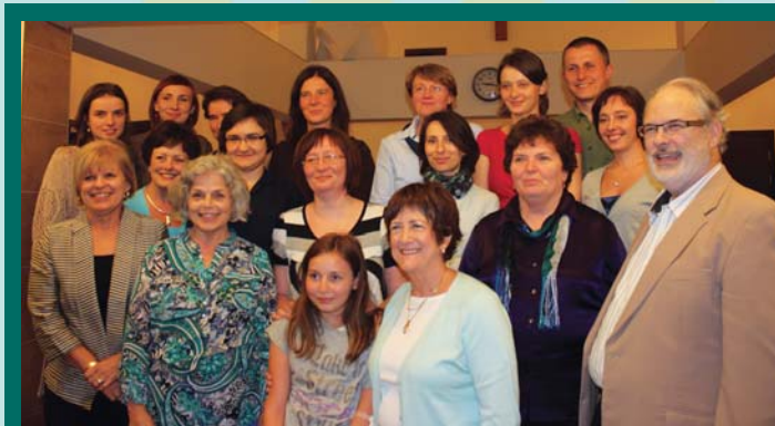
Faculty and Educator Intern students at Education Phase I in Poland, September 2012