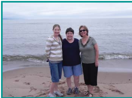
Employees from the Pope Paul VI Institute's FertilityCare™ Center of Omaha who attended the annual meeting in Duluth, Minnesota, July 2011.